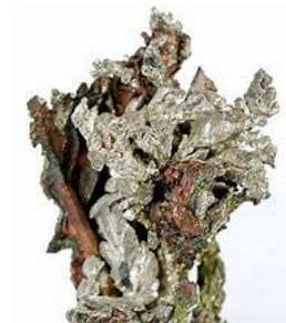
Silver with Copper Wolverine Mine